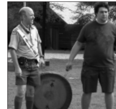
The judging crew made its decisions known with a large gong and some rather ugly scowls.

Following the camp fire some Brothers indulged in the time-honored practice of patch trading while others studied the cinematic art of the Teenaged Mutant Ninja Turtles. The evening's cracker barrel left everyone sated and, as