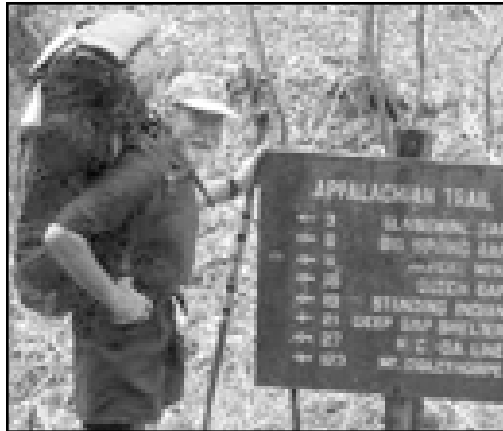
Model-T on the AT

At the Spring Fellowship, March 19 - 21, we will