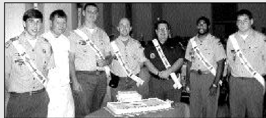
Seven past Lodge Chiefs prepare to cut Muscogee's 60th anniversary cake.

The attendance of the banquet was very high for an event that had to be rescheduled because of snow. I would like to thank all 140 members and families who were able to attend.