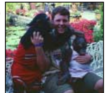
Scouts the world over just know how to make friends.