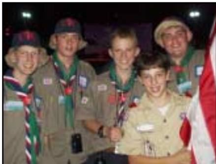
United Kingdom Scouts and a Scout from the United States.