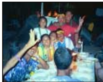
Thai Scouts are introduced to southern barbecue.

Scouts participated in cultural swaps ... eating with Scouts from different cultures every night ... service projects ("Do a Good Turn Daily"), swim-