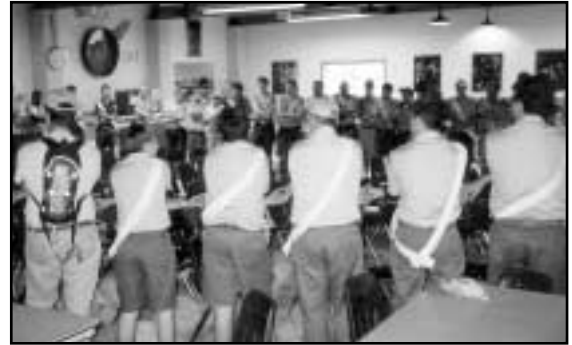
The Lodge singing the song of our order as we close the Lodge Business Meeting at the Fall Fellowship.

Committee Meeting's main topic was the Winter Banquet. The Executive Committee voted on to hold the 2003 Winter Banquet at Camp Barstow. Another issue discussed was Arrow Tech 2002, held in Greenville, SC in early November. Finally, taking affect in the upcoming year, those who purchase Red Fox Cards can expect the price to be raised two dollars.